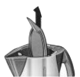
Figure 2 (to remove lid)